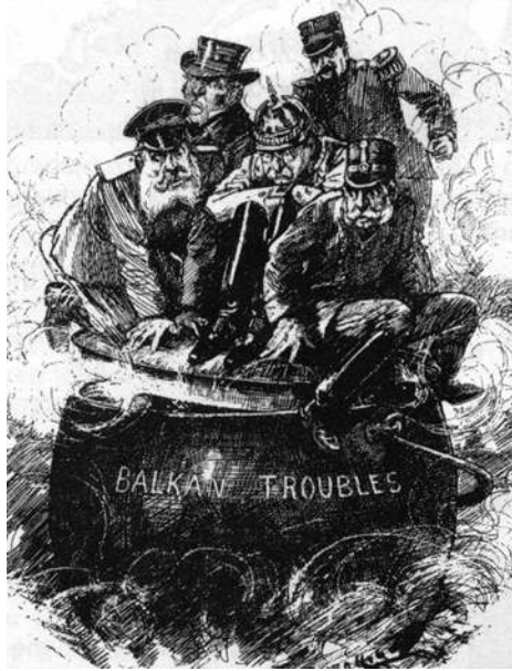
A British cartoon entitled 'The Boiling Point', published in 1912. The figures represent the five Great Powers.