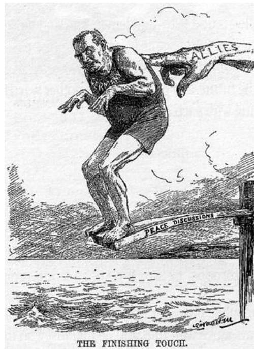
A cartoon published in Britain in 1919.