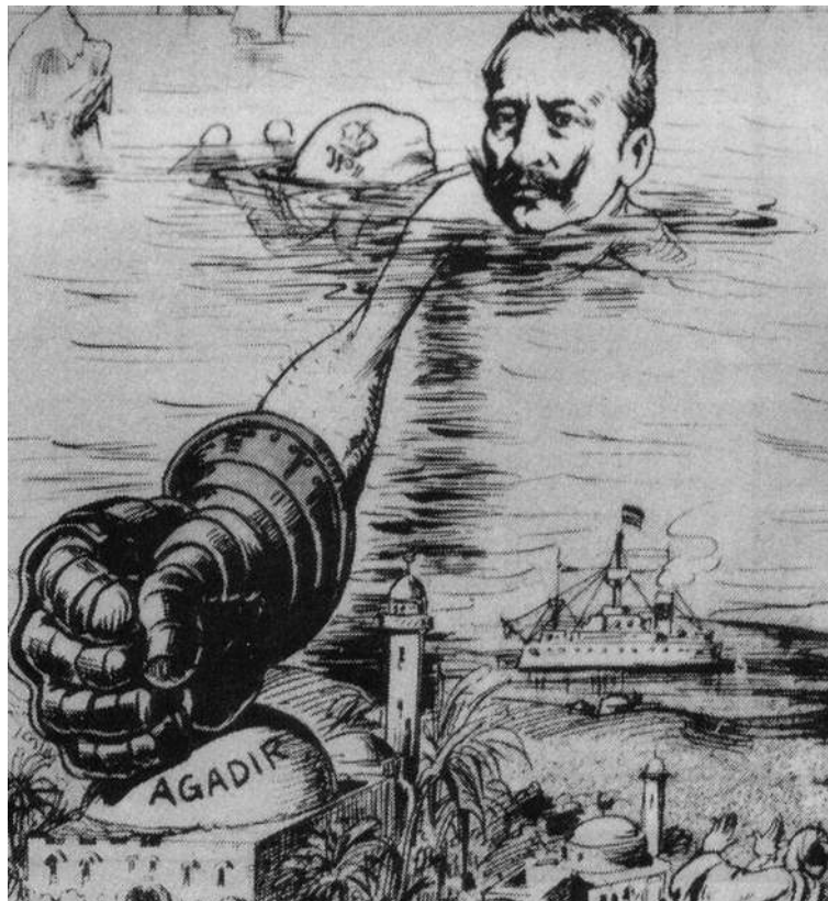
A German cartoon entitled 'The Iron Fist of Agadir', published in 1911.