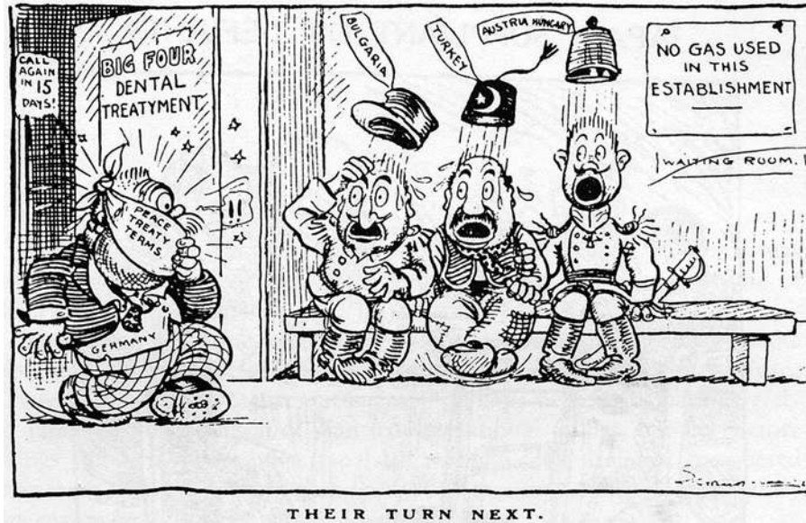
A cartoon from a British newspaper, May 1919. It shows the waiting room of a dentist.